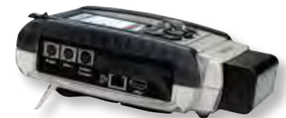
Data connections on the Access Portable are easy to access.