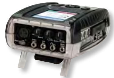
An integrated stand makes ACCESS Portable a table-top codec with conveniently located audio connections.