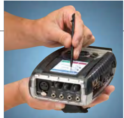
ACCESS Portable sits securely in the palm of your hand for easy interaction and configuration.

For remotes requiring multiple inputs, just add the optional ACCESS Portable Mixer. It just plugs into a multi-pin connector on the side of the ACCESS Portable and suddenly you’ve increased your inputs and mixing capabilities by five!