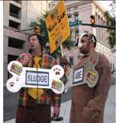
Cox Radio Richmond's WDYL-FM, "Y 101 New Rock!", loves the ability to move freely through the crowd with their ACCESS Portable.