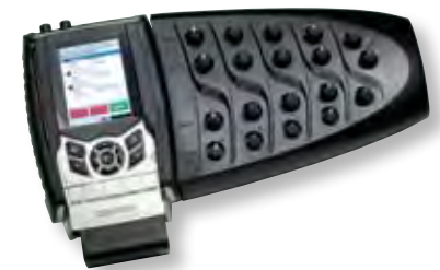
The optional mixer for the ACCESS Portable means you have to lug a LOT less gear to get a LOT more accomplished.