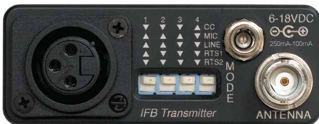
The rear panel provides the audio input and programming DIP switches for intercom and audio input type along with power and antenna input jacks.

256 UHF frequencies in 100kHz steps provide exceptional flexibility in coordinating frequencies in multi-channel wireless systems and avoiding interference from external RF signal sources and noise.