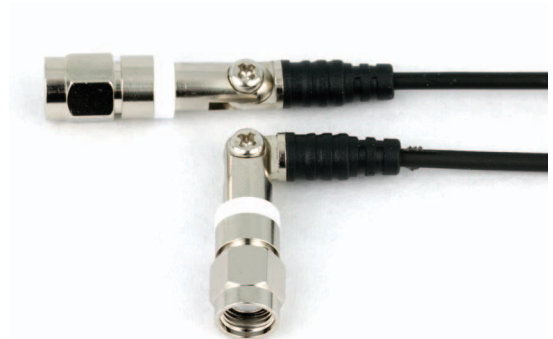
The hinged joint pivots in both directions