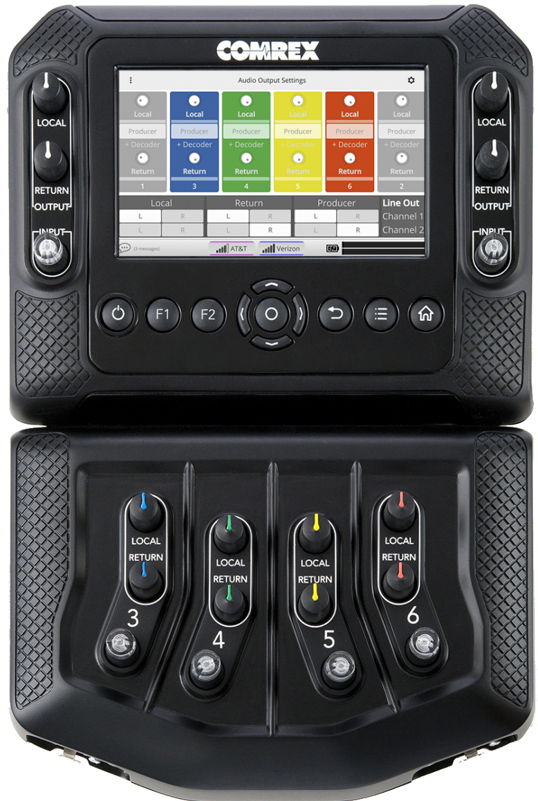
ACCESS NX Portable with optional 4-channel mixer