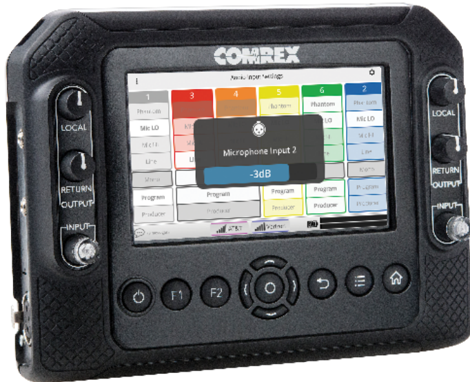
ACCESS NX Portable