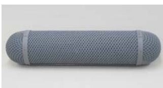
WS-4 Cage windshield