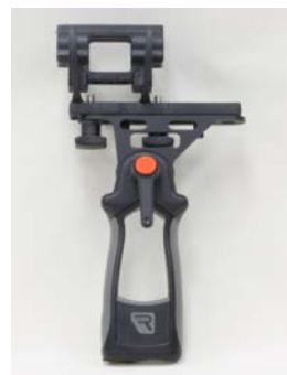
GS-23 Suspension handgrip