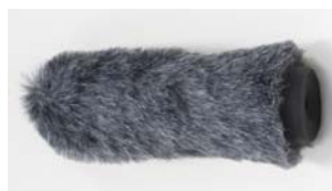
WSJ-23 Softie windjammer