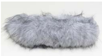
WJ-4 Windjammer for WS-4