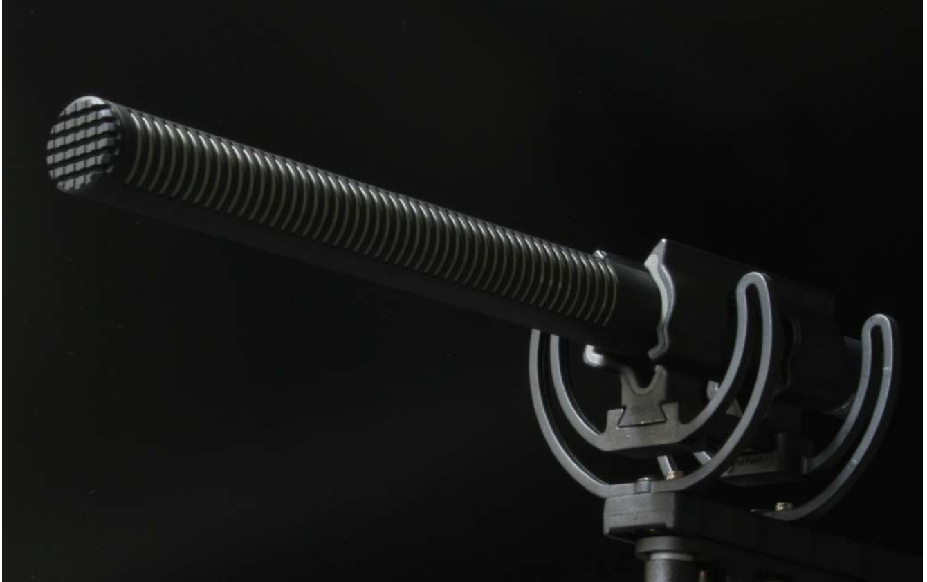
The suspension handgrip is an optional accessory.